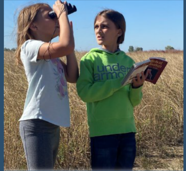
Photos Left to Right: 4th-grade students and teachers experience safe paddling by Big Muddy Adventures. A USACE St. Louis District Park Ranger assists a student while fishing. Students engaged in birding activities as part of a nature walk.